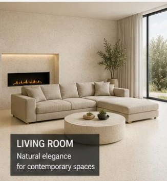
LIVING ROOM Natural elegance for contemporary spaces