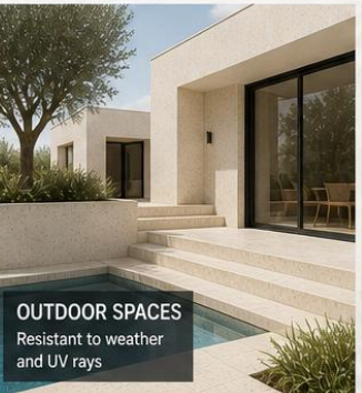
OUTDOOR SPACES Resistant to weather and UV rays