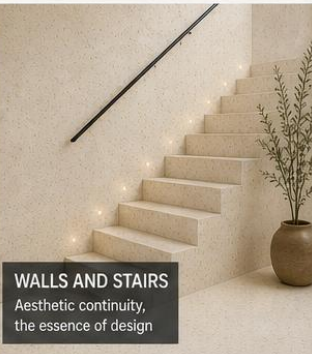
WALLS AND STAIRS Aesthetic continuity, the essence of design