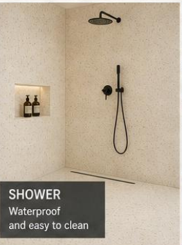
SHOWER Waterproof and easy to clean