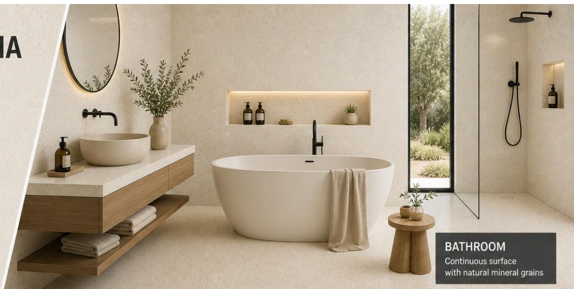
BATHROOM Continuous surface with natural mineral grains