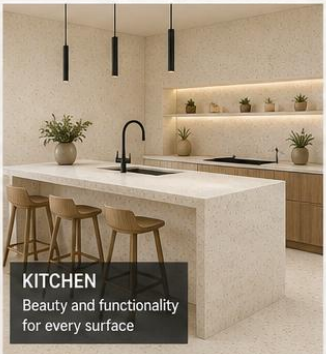
KITCHEN Beauty and functionality for every surface