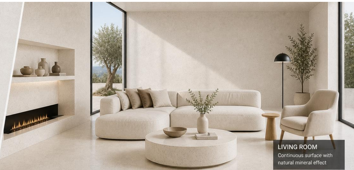
LIVING ROOM Continuous surface with natural mineral effect