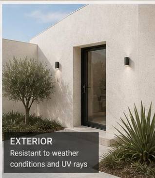
EXTERIOR Resistant to weather conditions and UV rays