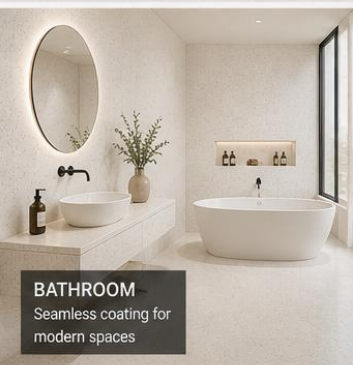
BATHROOM Seamless coating for modern spaces