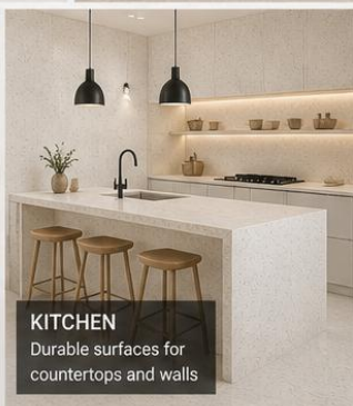
KITCHEN Durable surfaces for countertops and walls