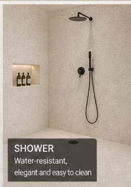
SHOWER Water-resistant, elegant and easy to clean