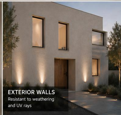
EXTERIOR WALLS Resistant to weathering and UV rays