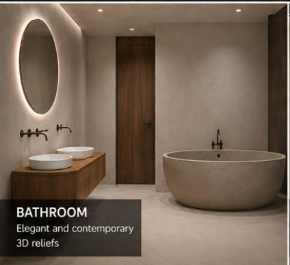
BATHROOM Elegant and contemporary 3D reliefs