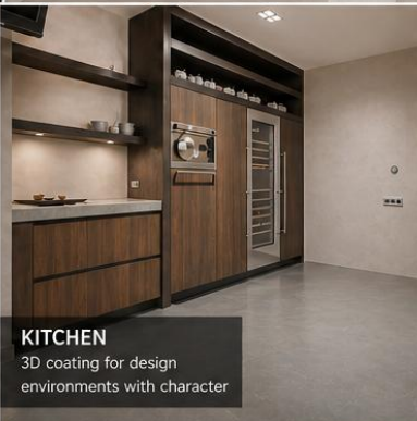
KITCHEN 3D coating for design environments with character