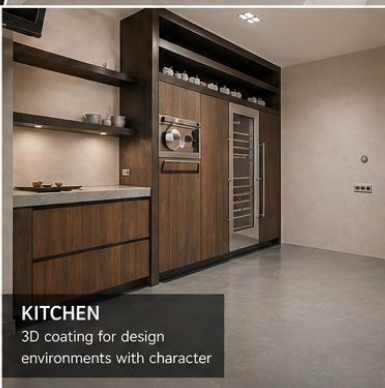
KITCHEN 3D coating for design environments with character