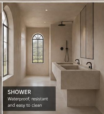
SHOWER Waterproof, resistant and easy to clean