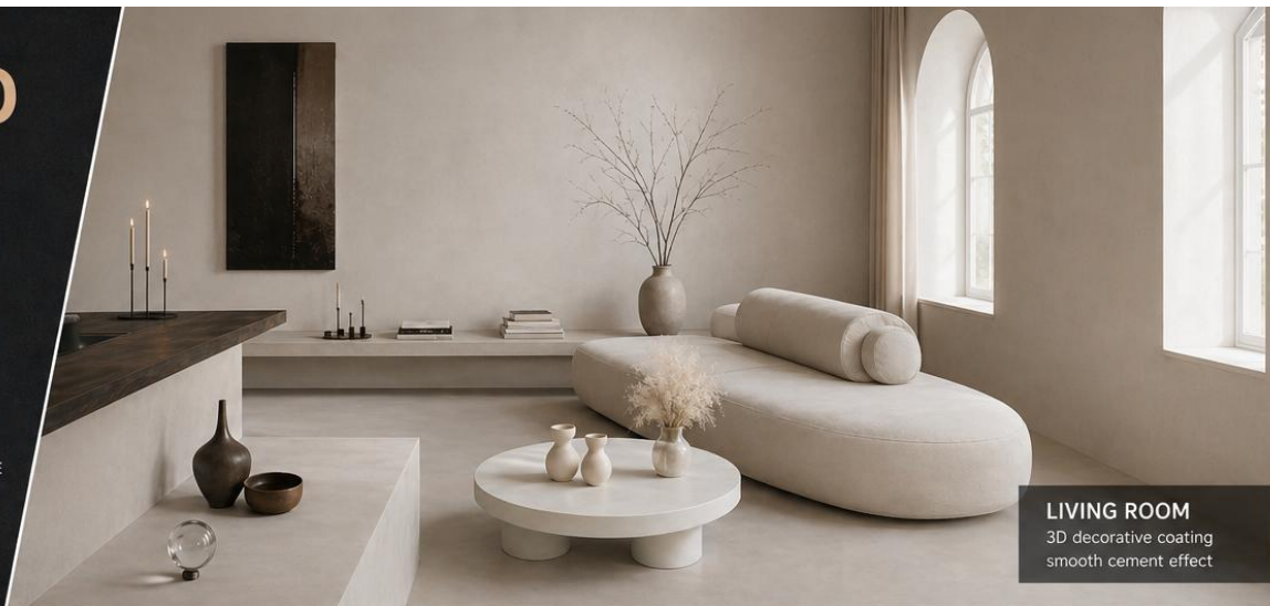
LIVING ROOM 3D decorative coating smooth cement effect