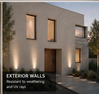
EXTERIOR WALLS Resistant to weathering and UV rays