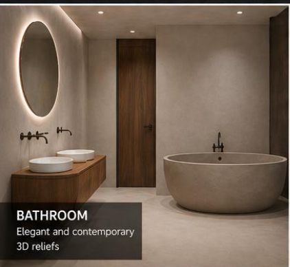
BATHROOM Elegant and contemporary 3D reliefs